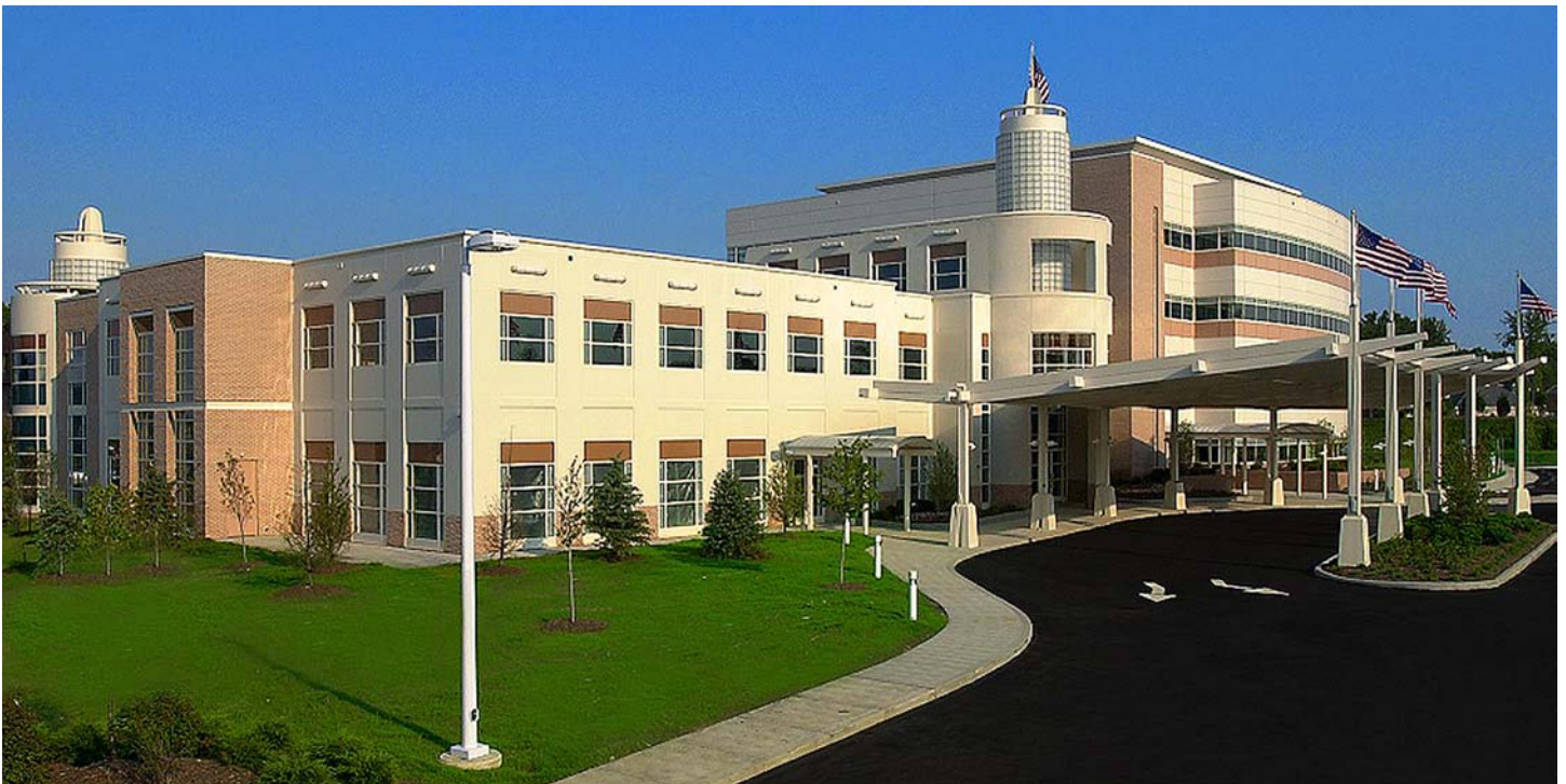
LaCentre Conference and Banquet Facility

Be sure to mark September 9 th in your appointment book now – you won't want to miss this extraordinary event!